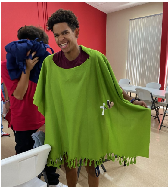
Next generation is outstanding. When faced with a blanket with a hole in the center, the team made it into a poncho!