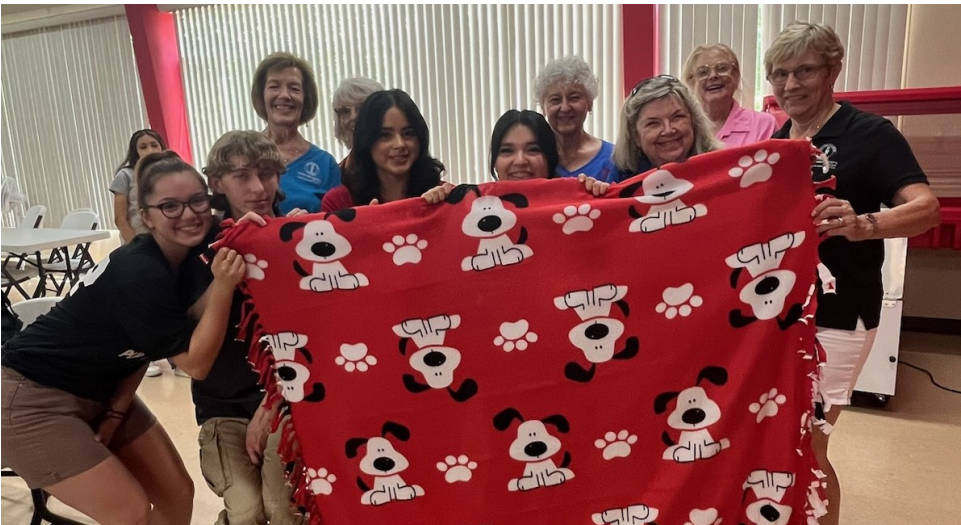
Some of the Junior Class ask us to join them in a picture that might be in their yearbook!